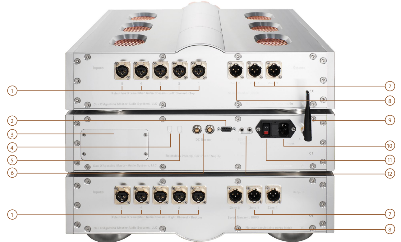
Audio Chassis and Power Supply (rear)