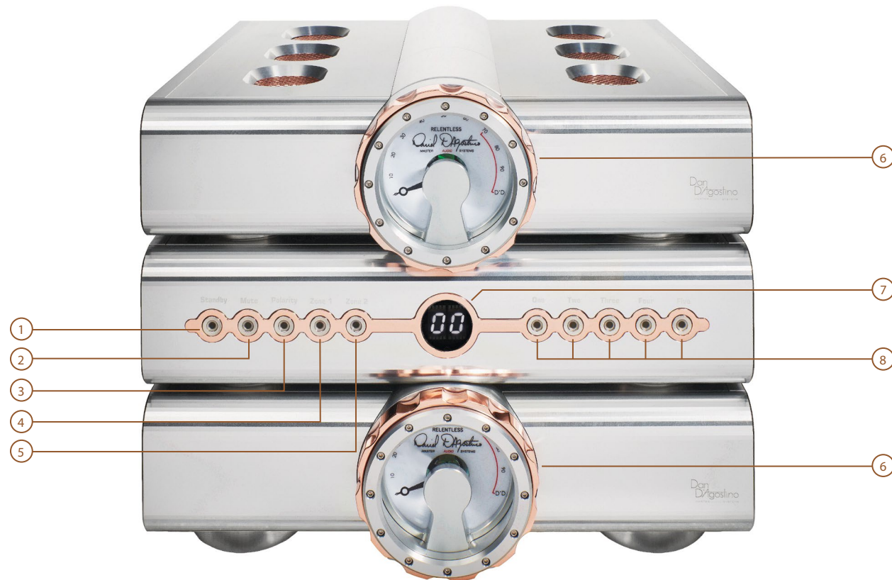
Audio Chassis and Power Supply (front)